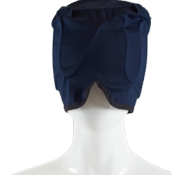
EXTENDED HEAD CAP (#HCL)

"I absolutely love this head cap and would recommend it to anyone suffering from frequent migraines."