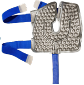
KNEE & JOINT (#KB)