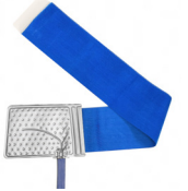
BACK & HIP (#LB)