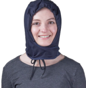
HEAD CAP (#HC)