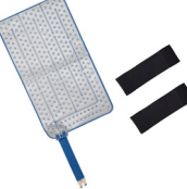
FULL CIRCUMFERENCE KNEE (#KBFULL)

"I had a total knee replacement and it's been so helpful. I have to say, this is a lifesaver – I love this product. I highly recommend this."