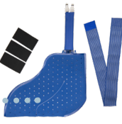
FOOT & ANKLE (#FB)