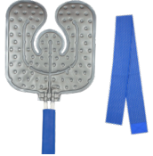
UNIVERSAL "U" (#UB)