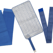
EXTENDED COVERAGE HIP (#HP)

"After my total hip replacement, this product was so helpful with my pain relief. I used the ice bottles so I didn't have to empty the cooler every day."